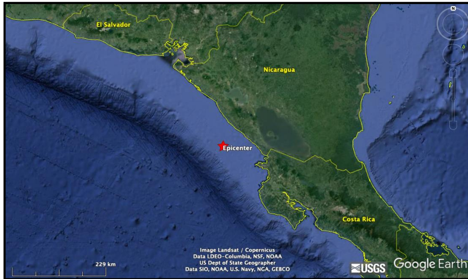
Figure 1 Information from the Earthquake Hazards Program of the United States Geological Survey, regarding the earthquake event on 15 January 2019.

A magnitude 5.3 earthquake occurred at 03:41:04 UTC on 15 January 2019 (14 January 2019 21:41:04 local time), 56.7 km (35.2 mi) NNE of Masachapa, Nicaragua; 65.4 km (40.6 mi) NNE of San Rafael del Sur, Nicaragua and 75.9 km (47.1 mi) NNE of Diriamba, Nicaragua. Initial estimates from the United States Geological Survey (USGS) located the epicentre of the event (Figure 1) at 11.285°N, 86.621°W, and at a depth of 36.2 km (22.5 mi). Nicaragua was the only CCRIF member country where peak ground acceleration, computed with the MPRES model, was greater than 0.01g for this earthquake.