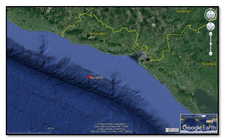
Figure 1 Information from the Earthquake Hazards Program of the United States Geological Survey, regarding the earthquake event on 26 March 2019.

A magnitude 5.6 earthquake occurred at 12:01:48 UTC on 26 March 2019 (06:01:48 local time), 110.2 km (68.5 mi) N of La Libertad, El Salvador; 114.4 km (71.1 mi) NE of Puerto El Triunfo, El Salvador and 118 km (73.3 mi) NNE of Zacatecoluca, El Salvador. Initial estimates from the United States Geological Survey (USGS) located the epicentre of the event (Figure 1) at 12.496°N, 89.233°W, and at a depth of 10.0 km (6.2 mi). Nicaragua was the only CCRIF member country where peak ground acceleration, computed with the MPRES model, was greater than 0.01g for this earthquake.