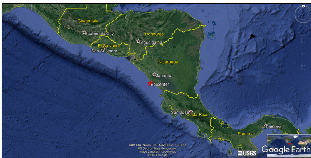
Figure 1 Information from the Earthquake Hazards Program of the United States Geological Survey regarding the earthquake event on 12 July 2021 at 23:26:35 UTC.

Final runs of CCRIF's loss model estimated no government losses for Nicaragua and therefore no payout is due.