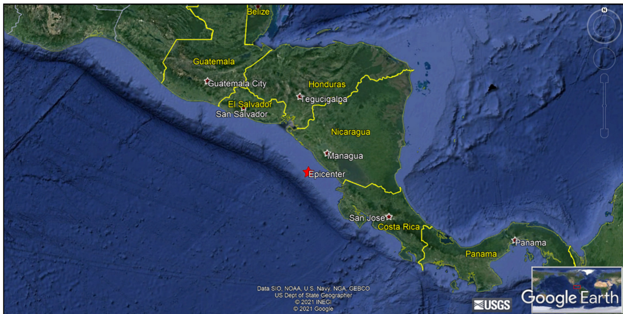
Figure 1 Information from the Earthquake Hazards Program of the United States Geological Survey regarding the earthquake event on 22 July 2021 at 01:28:26 UTC.

Final runs of CCRIF’s loss model estimated no government losses for Nicaragua and therefore no payout under the country’s earthquake policy is due.