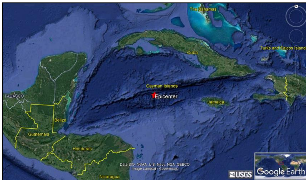
Figure 1 Information from the Earthquake Hazards Program of the United States Geological Survey regarding the earthquake event on 16 October 2021 at 18:27:29 UTC. Source: USGS 1

Preliminary runs of CCRIF’s loss model estimated no government losses for the Cayman Islands and therefore no payout under the country’s earthquake policy is due.