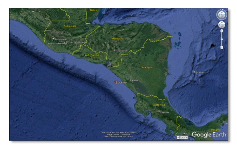
Figure 1 Information from the Earthquake Hazards Program of the United States Geological Survey regarding the magnitude 6.1 earthquake event on 6 January 2022 at 16:25:07 UTC.

A magnitude 6.1 earthquake occurred at 16:25:07 (UTC) on 6 January 2022, 56.8 km (35.3 mi) S of Corinto, Nicaragua; 57.7 km (35.9 mi) SSW of León, Nicaragua and 63 km (39.1 mi) SW of La Paz Centro, Nicaragua. Initial estimates from the United States Geological Survey (USGS) located the epicentre of the event at 11.975°N, 87.118°W, and at a depth of 21.7 km (13.5 mi) – Figure 1.