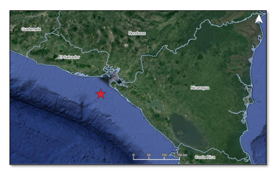
Figure 1 Information from the Earthquake Hazards Program of the United States Geological Survey regarding the earthquake event on 27 February 2023 at 18:46:06 (UTC).

A magnitude 5.3 earthquake occurred at 18:46:06 (UTC) on 27 February 2023, 55.1 km (34.2 mi) E of Jiquilillo, Nicaragua; 85 km (52.8 mi) E of El Viejo, Nicaragua and 86.4 km (53.7 mi) ESE of Corinto, Nicaragua. Final estimates from the United States Geological Survey (USGS) located the epicentre of the event at 12.652°N, 87.950°W, and at a depth of 77.3 km (48.03 mi).— Figure 1.