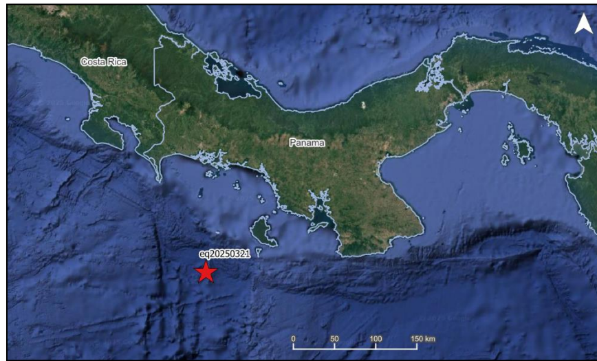
Figure 1 Information from the Earthquake Hazards Program of the United States Geological Survey regarding the earthquake event on 21 March 2025.

A magnitude 6.2 earthquake occurred at 14:50:51 (UTC) on 21 March 2025, located at 123.9 km (77 mi) NNW of Burica, Chiriquí Province, Panama; 149.4 km (92.8 mi) N of Pedregal, Chiriquí Province, Panama and 148.4 km (92.2 mi) NNW of Puerto Arguelles, Chiriquí Province, Panama. Initial estimates from the United States Geological Survey (USGS) located the epicentre of the event at 7.036°N, 82.372°W, and at a depth of 10 km (6.21 mi) – Figure 1.