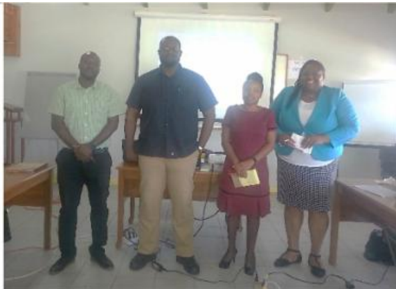
Leaders from the small groups in the Montserrat workshop prepare to present their "recommendations" of policy options for the Government