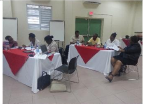
Participants from the Antigua and Barbuda training

CCRIF is offering this training programme to all member countries. Since the training programme was launched in December 2016, CCRIF has delivered the programme to approximately 200 persons in 11 of its 21 member countries. Participants have included representatives from ministries of finance and the disaster management and meteorology agencies – as well as, other ministries and agencies responsible for areas including water resource management, planning, agriculture, environmental management, infrastructure and works, climate change and sustainable development.