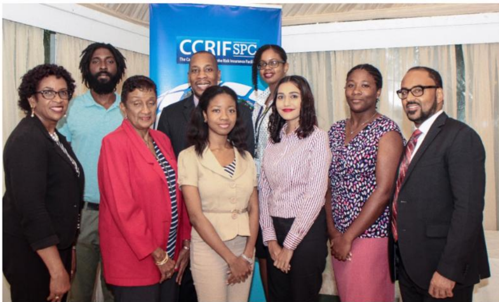
Some of the 2018 interns who worked in Jamaica met with the CCRIF Board and CEO and representatives from UWI in September 2018

In this initiative, CCRIF has partnered with over 20 organizations who have agreed to act as host organizations. These include national disaster management and meteorology agencies as well as: