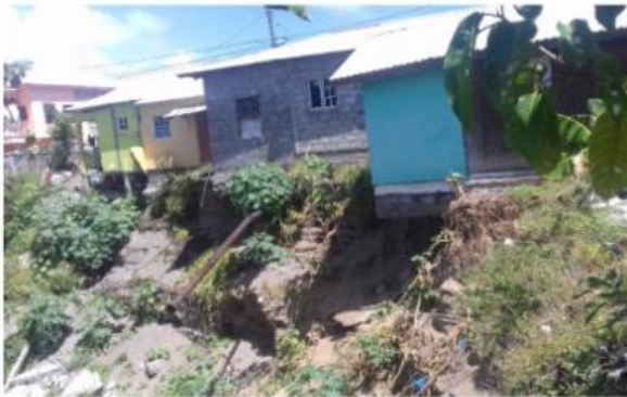
Example of buildings at risk

CCRIF is working with the OECS Commission on a project designed to support disaster risk reduction (DRR) measures in member states by working with community residents to develop local DRR plans. Vulnerability assessments have been conducted in Saint Lucia and St. Vincent and the Grenadines – focusing on three of the most vulnerable communities in each country: Anse La Raye, Dennery and Malgretoute/Vollet in Saint Lucia and Sandy Bay, Langley Park and Paget Farm (Bequia) in St. Vincent and the Grenadines.