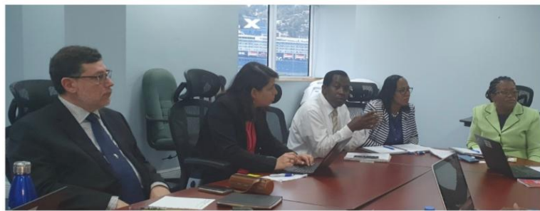
Members of the World Bank Team engage with technocrats from the Accountant General's Department in Saint Lucia

relevant to vulnerable fishing communities. Leveraging CCRIF's existing models for tropical cyclone and excess rainfall, the COAST insurance product will support governments' efforts to rapidly provide resources for those impacted by extreme weather in the fisheries and aquaculture sector, providing them with immediate economic relief and promoting a culture of building back better to enhance coastal community resilience after an extreme weather event.