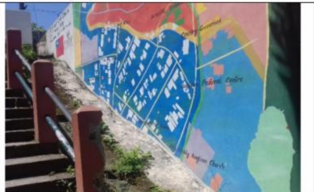
Flood map painted on a wall in the Springs community

For both Saint Lucia and St. Vincent and the Grenadines, the initial vulnerability assessment was