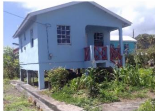
Example of building raised to “escape” flood waters

This project is using the Community Disaster Risk Reduction Framework , which is a fit-for-purpose tool specifically designed for conducting vulnerability assessment. It examines and seeks to quantify the indicators of social, physical and economic vulnerability and geo-references these to specific areas within the community. This framework includes: