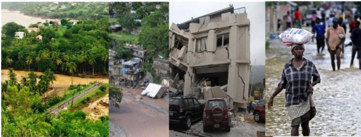
The Case of CCRIF SPC

Contact: Sustainability Managers | Corporate Communications Manager | pr@ccrif.org