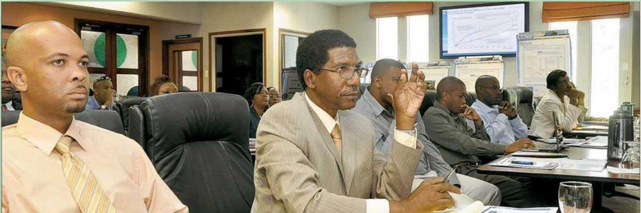
Participants at the ECA workshop