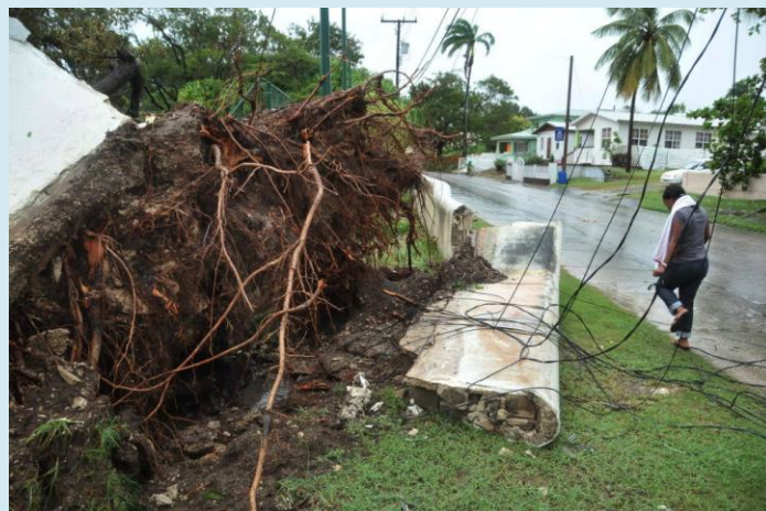
Damage in Barbados following the passage of Tropical Cyclone Tomas