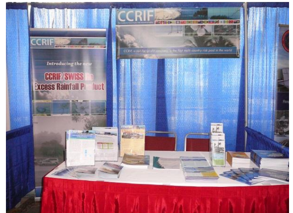
View of the CCRIF Booth

CCRIF has been a sponsor of the CDM Conference since 2008 and has contributed over this time in excess of US$200,000 to the staging of the conference.